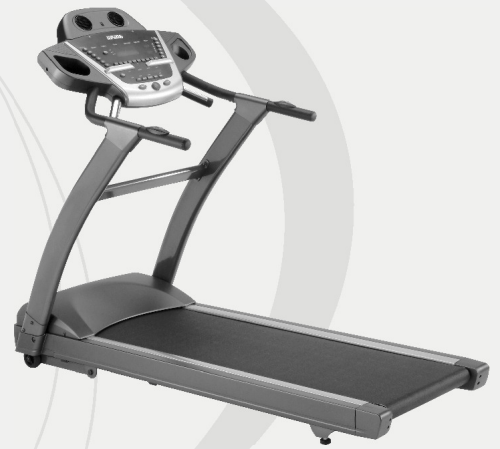
Z700 Motorized Treadmill