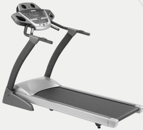
Z500 Motorized Treadmill