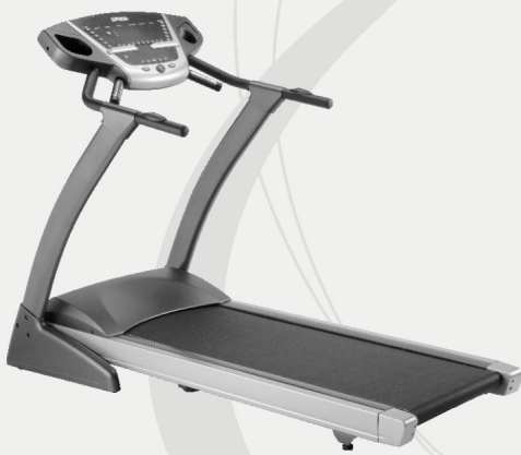
Z100 / Z300 Motorized Treadmill